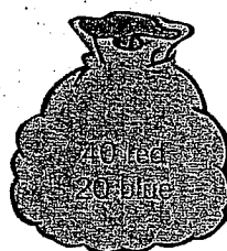
Bag y Total = 60 marbles