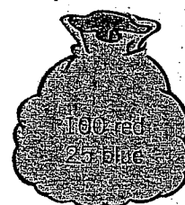
Bag z Total = 125 marbles

Ms. Rhee shook each bag. She asked the class, “If you close your eyes, reach into a bag, and remove 1 marble, which bag would give you the best chance of picking a blue marble?”